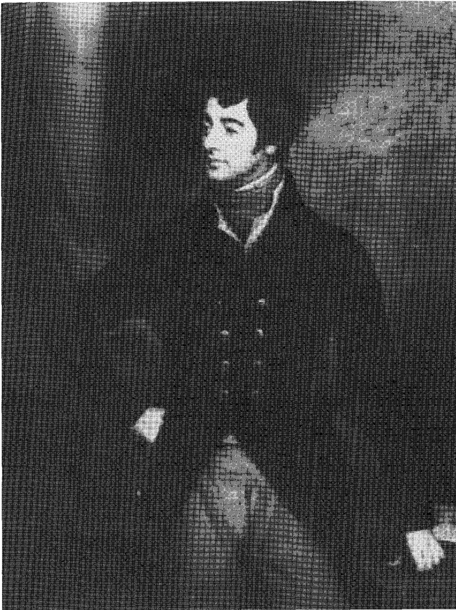
Lord Edward Fitzgerald by Hugh Douglas Hamilton